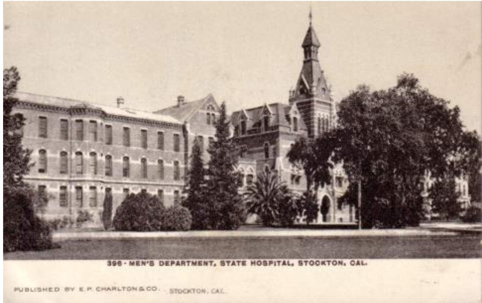
396 - MEN'S DEPARTMENT, STATE HOSPITAL, STOCKTON, CAL.

PUBLISHED BY E. P. CHARLTON & CO. - STOCKTON, CAL.