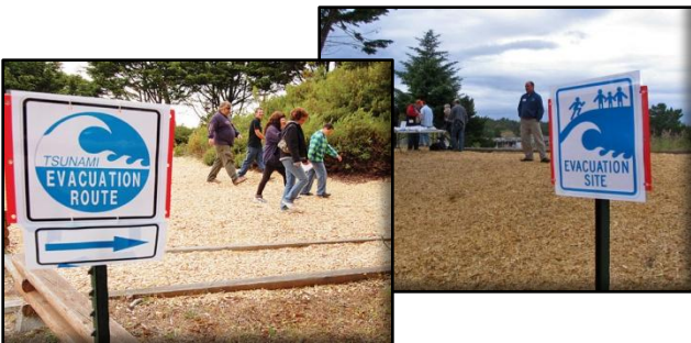
Pictures of evacuation drill in Samoa, California

Tsunamis can cause great loss of life and damage to property, as we learned in the 2004 Indian Ocean Tsunami which killed over 200,000 people in eleven different countries. The key to surviving a tsunami is to know what the warning signs are, and know what to do and where to go if you think a tsunami is about to strike.